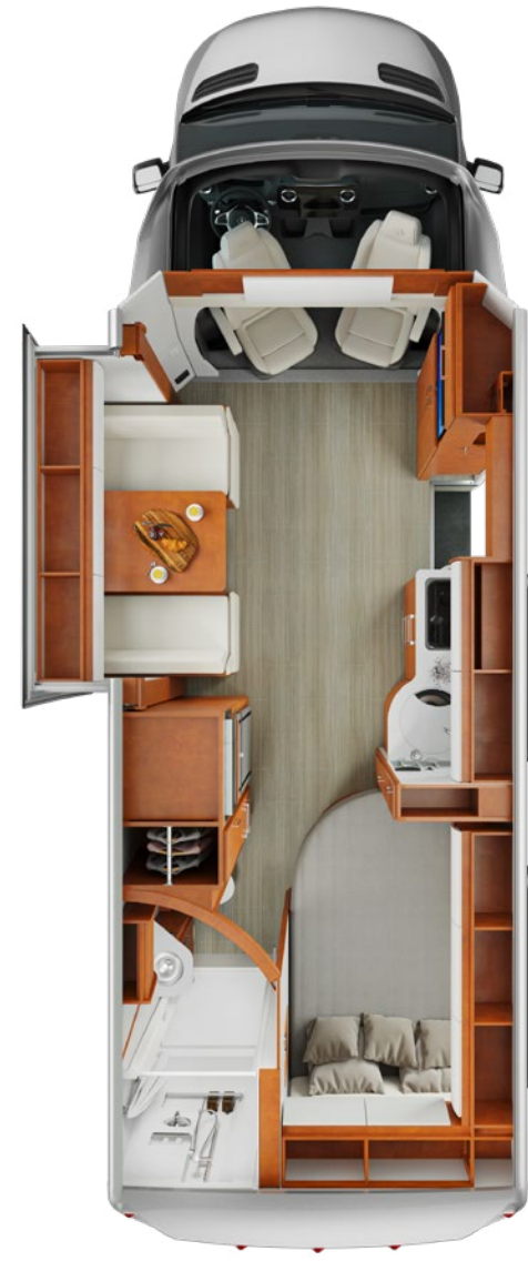
U24CB | Corner Bed (Shown with Standard Dinette)