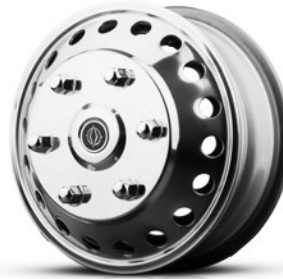
Steel Wheels Standard – With Wheel Simulators