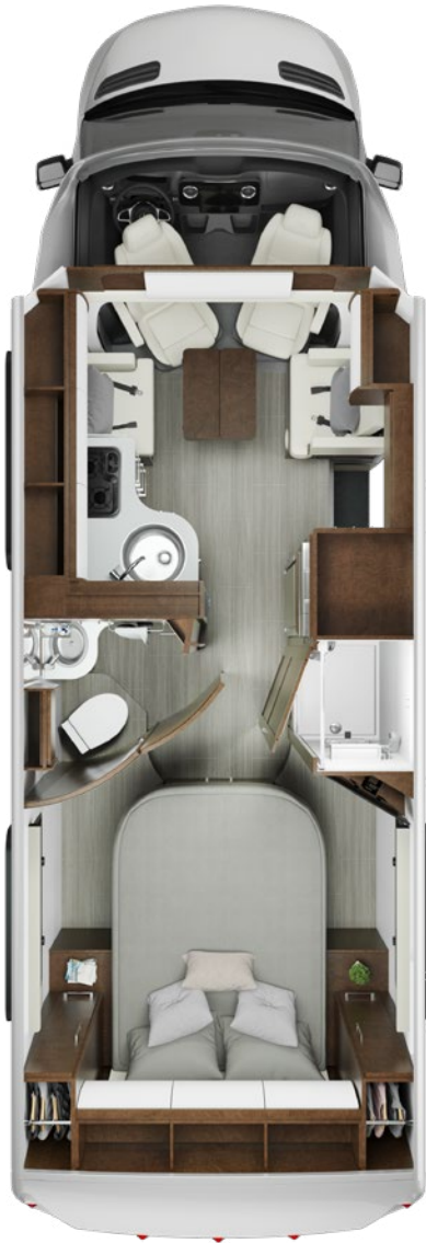
U241B | Island Bed