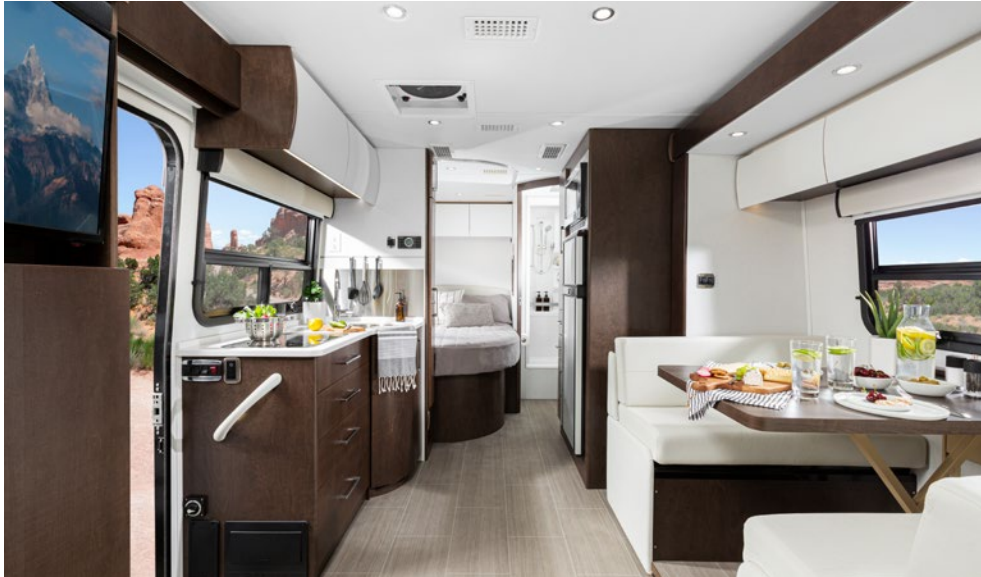
Espresso Brown Shown with Bianco White Fenix Glamour Upgrade