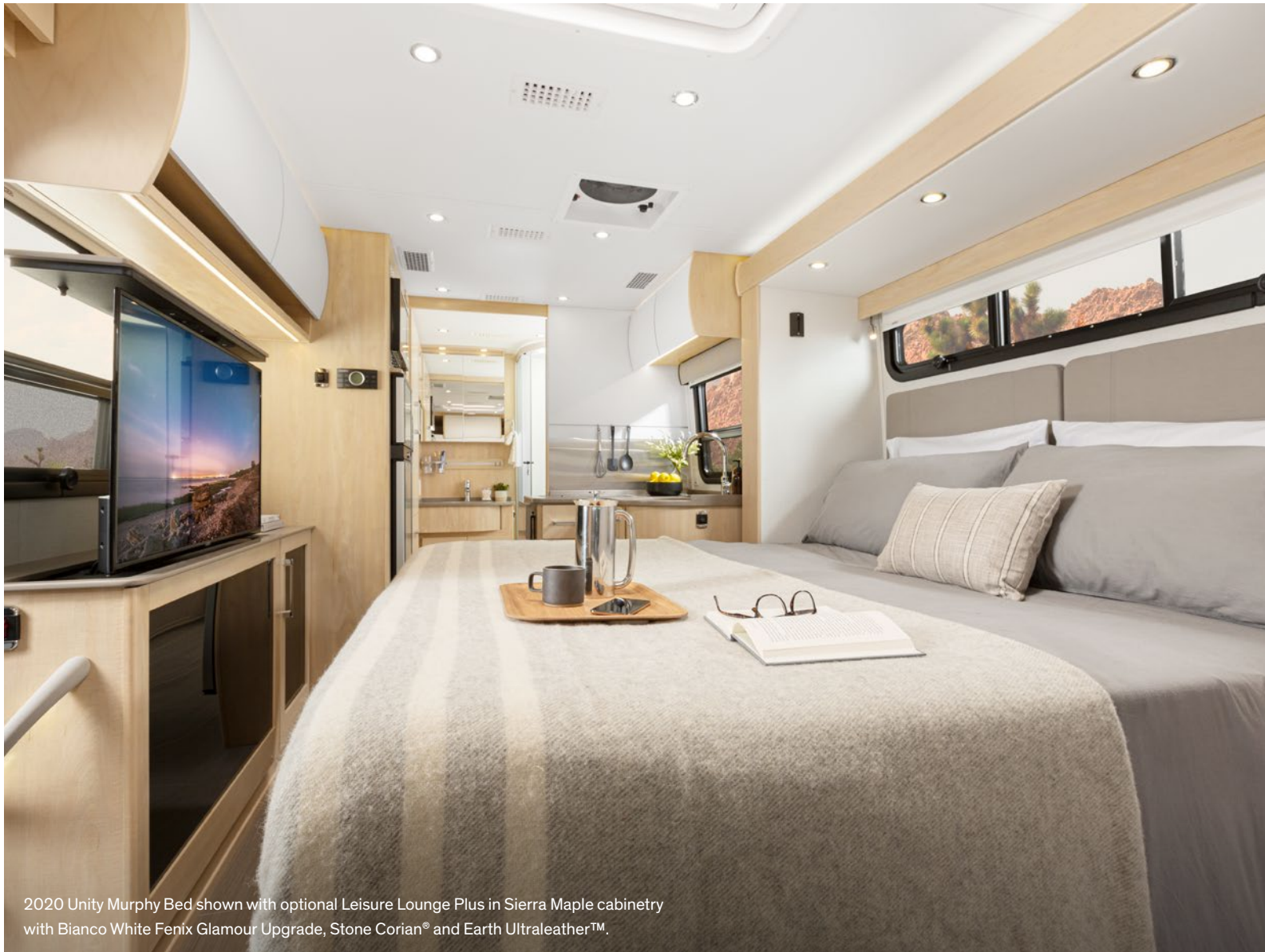
2020 Unity Murphy Bed shown with optional Leisure Lounge Plus in Sierra Maple cabinetry with Bianco White Fenix Glamour Upgrade, Stone Corian® and Earth Ultraleather™.