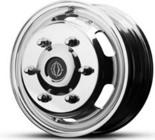
Alcoa Dura-Bright® Aluminum Wheels Optional – All 6 Aluminum Wheels, 4 Dura-Bright® Wheels