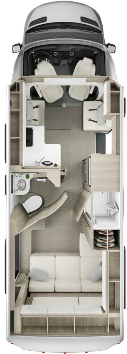
U24RL | Rear Lounge