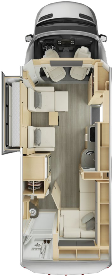
U24FX | FX