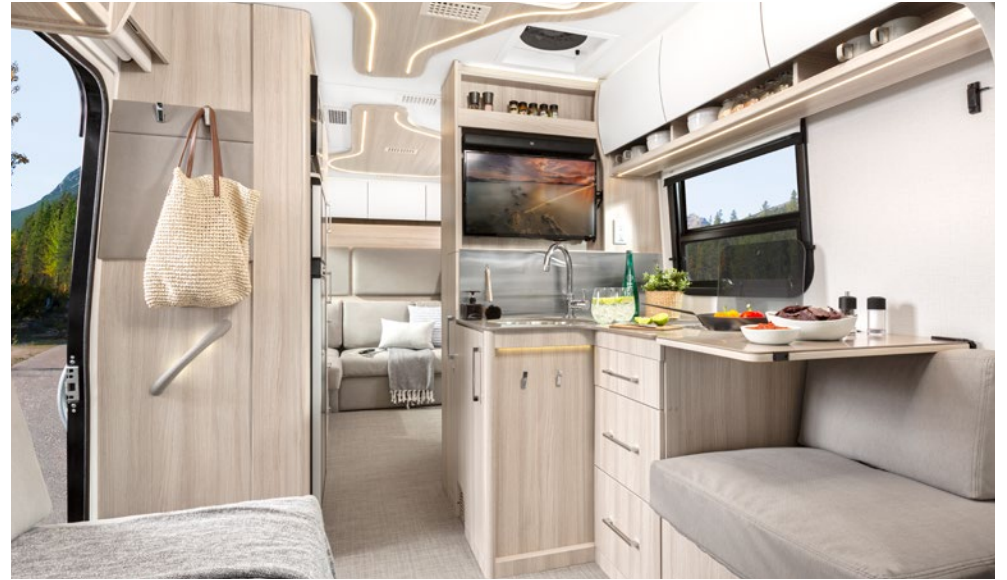
Cashmere (Exclusive to the Unity Rear Lounge) Shown with Bianco White Fenix Glamour Upgrade