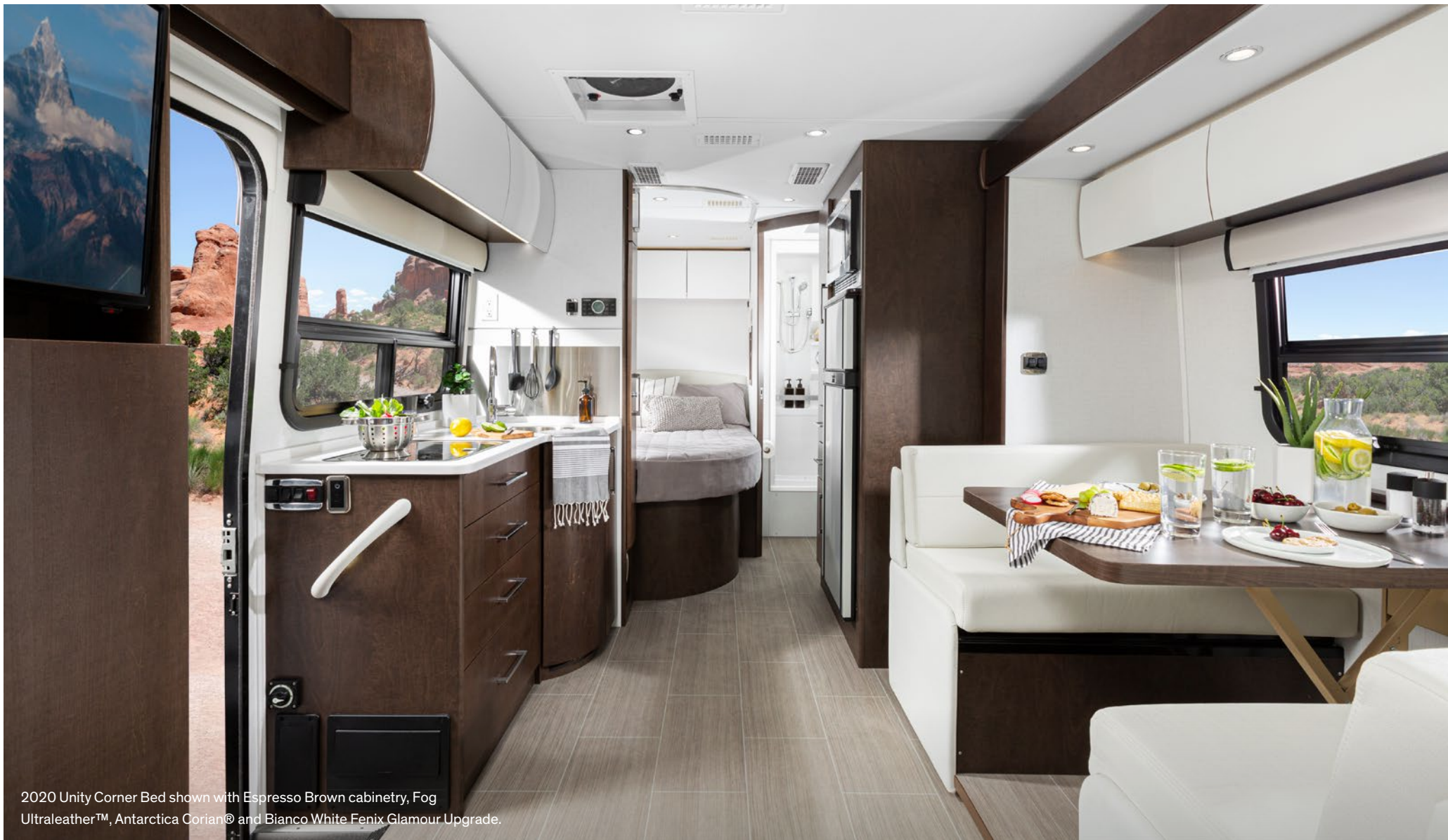
2020 Unity Corner Bed shown with Espresso Brown cabinetry, Fog Ultraleather™, Antarctica Corian® and Bianco White Fenix Glamour Upgrade.