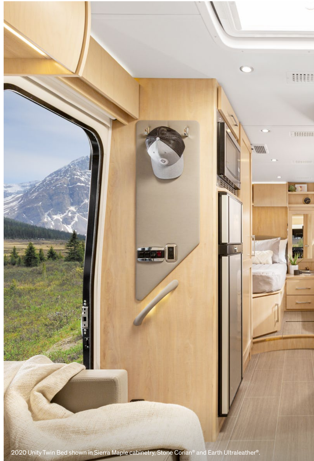
2020 Unity Twin Bed shown in Sierra Maple cabinetry, Stone Corian® and Earth Ultraleather®.