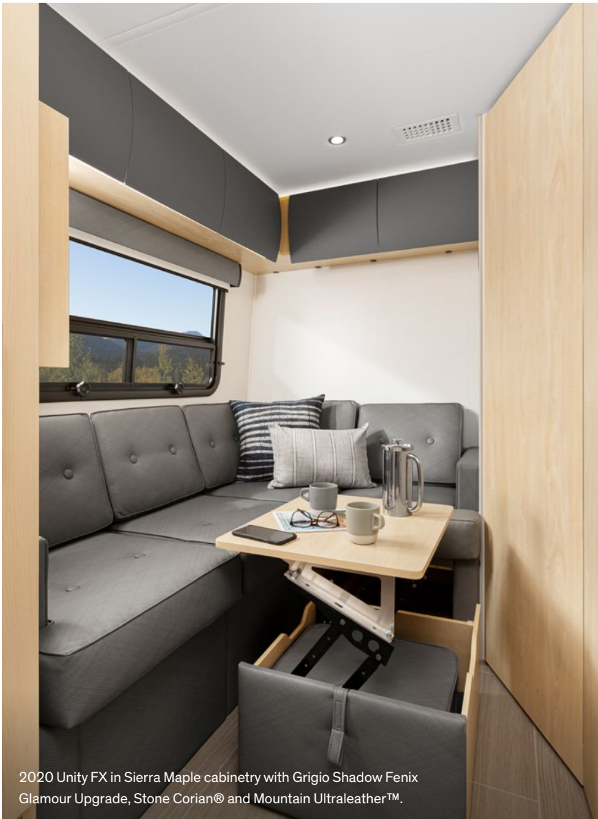
2020 Unity FX in Sierra Maple cabinetry with Grigio Shadow Fenix Glamour Upgrade, Stone Corian® and Mountain Ultraleather™.