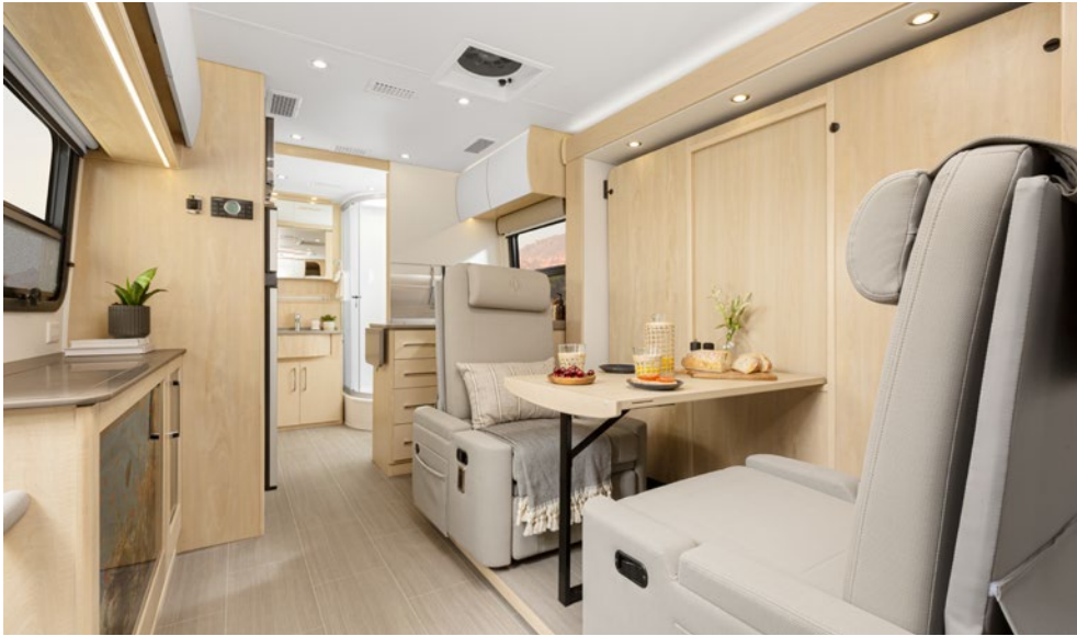
Sierra Maple Shown with Bianco White Fenix Glamour Upgrade