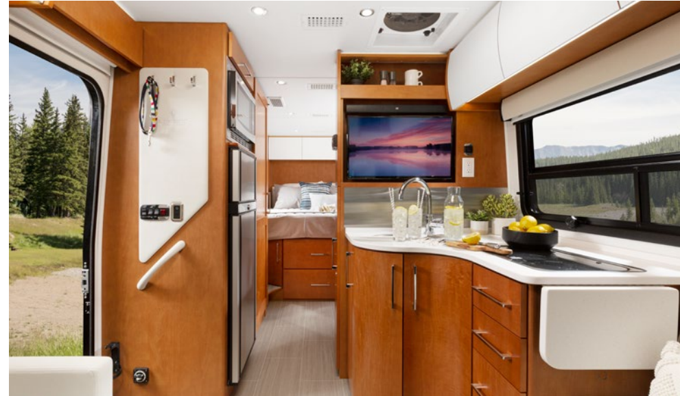
Chestnut Cherry Shown with Bianco White Fenix Glamour Upgrade