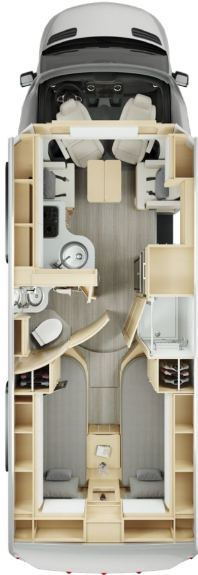
U242TB | Twin Bed