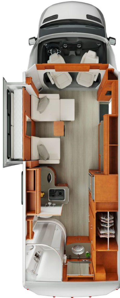
U24MB | Murphy Bed (Shown with standard Leisure Lounge)